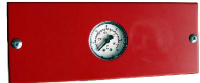
BIP01 with 1 pressure gauge for Open only box and Open Close