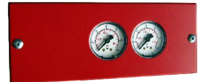
BIP02 with 2 pressure gauges for Dual-zone box

Material . . . . . : Steel, brass, aluminium, synthetic materials. Protection . . . . . : Paint. Maximum operating pressure . . . . . : 60 bar. Maximum supply pressure . . . . . : 60 bar. Connection . . . . . : Olive screw connection for pipes. Precautions . . . . . : Stock and install away from bad weather conditions.